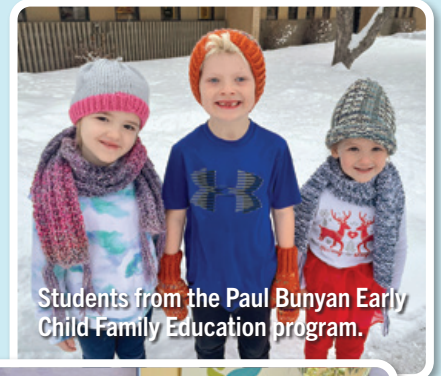
Students from the Paul Bunyan Early Child Family Education program.