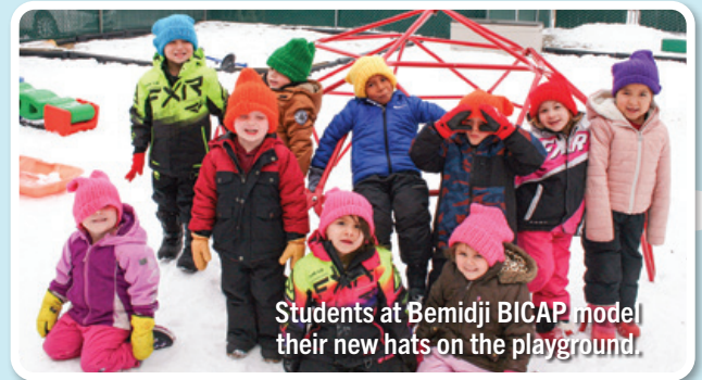
Students at Bemidji BICAP model their new hats on the playground.