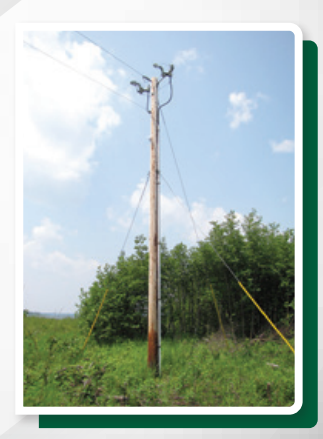
A : 19w2nA

* BEC has 19,197 poles on our system. We test and check them annually to ensure they are sound and in good condition. DO NOT ever attach anything to poles as this could present a serious safety hazard for lineworkers if a nail or staple snags or tears the gear that keeps them safe. DO NOT burn near power